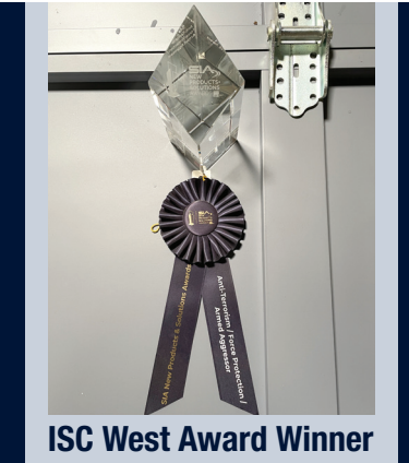
ISC West Award Winner